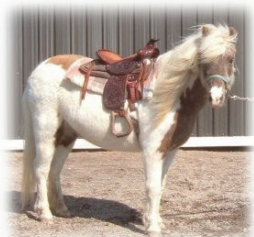
Pony Rides (1-3pm)