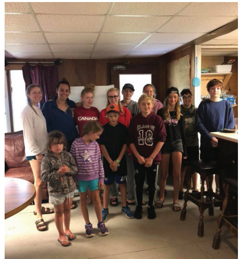
Junior Prize Fishers