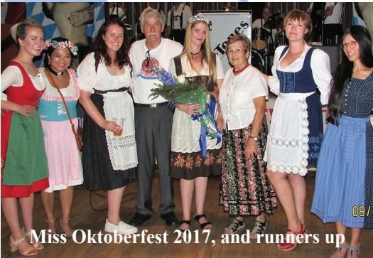
Miss Oktoberfest 2017, and runners up

Tapping of the Keg German Draught Beer Delicious German Food Miss Oktoberfest Contest Live Music by